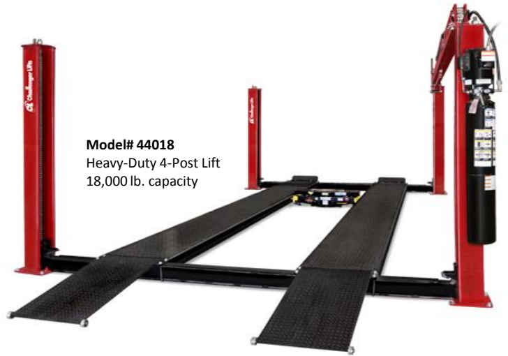
Model# 44018 Heavy-Duty 4-Post Lift 18,000 lb. capacity