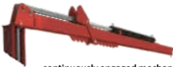
continuously engaged mechanical lock system for increased safety (Alignment Rack models feature single point air lock release)