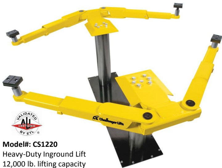
Model#: CS1220 Heavy-Duty Inground Lift 12,000 lb. lifting capacity

Challenger Lifts Heavy-Duty Inground Lifts are ideal for starting or expanding your commercial fleet service capabilities.