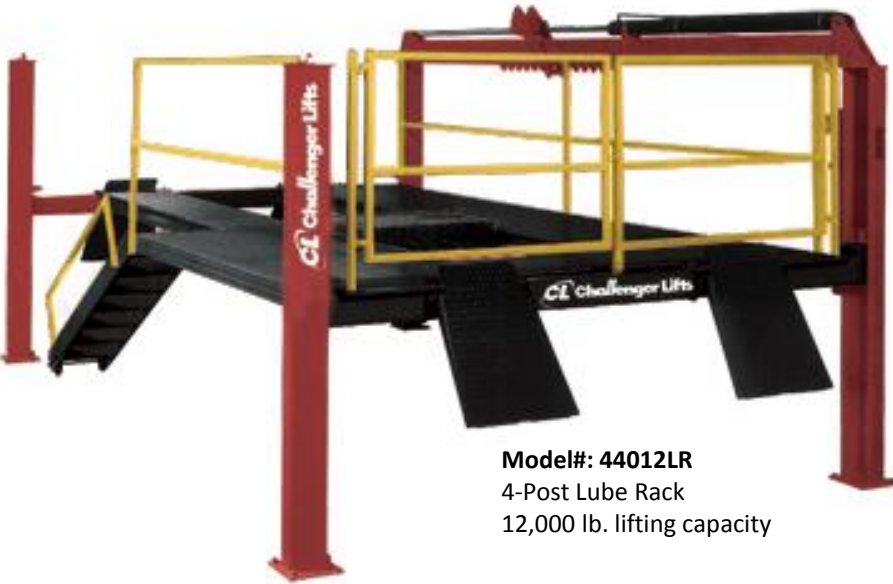
Model#: 44012LR 4-Post Lube Rack 12,000 lb. lifting capacity