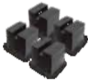
Four 41/8" spotting block auxiliary adapters Part#: 63100